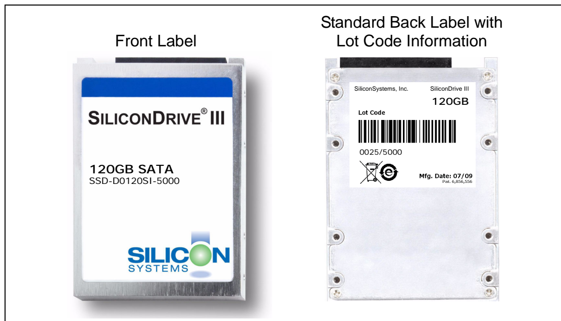
Figure 3: Sample Label